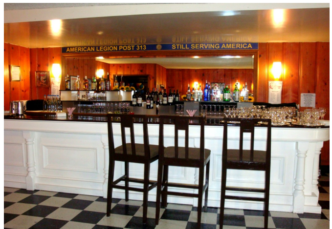
American Legion Post 313 * Still Serving America

We need your help! If you can tend bar, cook or help with cleanup, just say the word. We hope to see you and your guests at game time on Sundays thru the end of November. Be sure to check our post website calendar to be certain that a Sunday Bar Event has not been superseded by a rental.