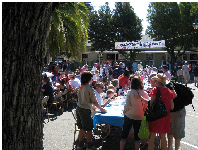
Twin Cities Post 313 Pancake Breakfast 2011